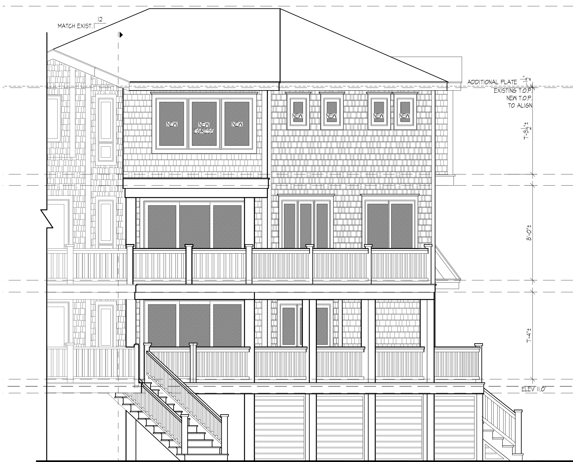
PROPOSED SIDE ELEVATION (BAY VIEW) SCALE: 1/4"=1'-0"