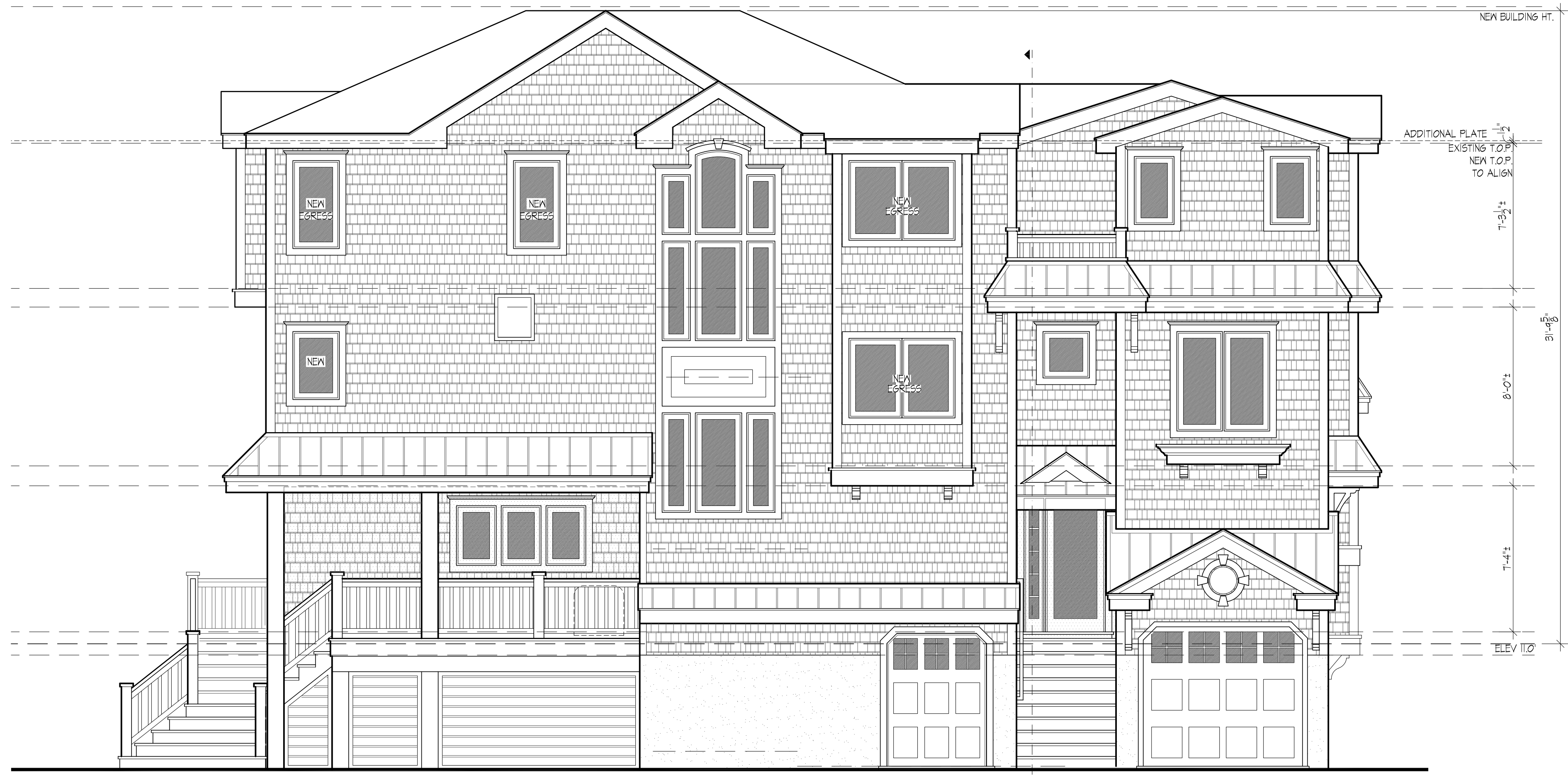
PROPOSED FRONT ELEVATION (SOUNDS AVE) SCALE: 1/4"=1'-0"

SEA ISLE CITY ZONING BOARD SIGNATURES BOARD CHAIRMAN: _____ BOARD ENGINEER: _____ BOARD SECRETARY: _____