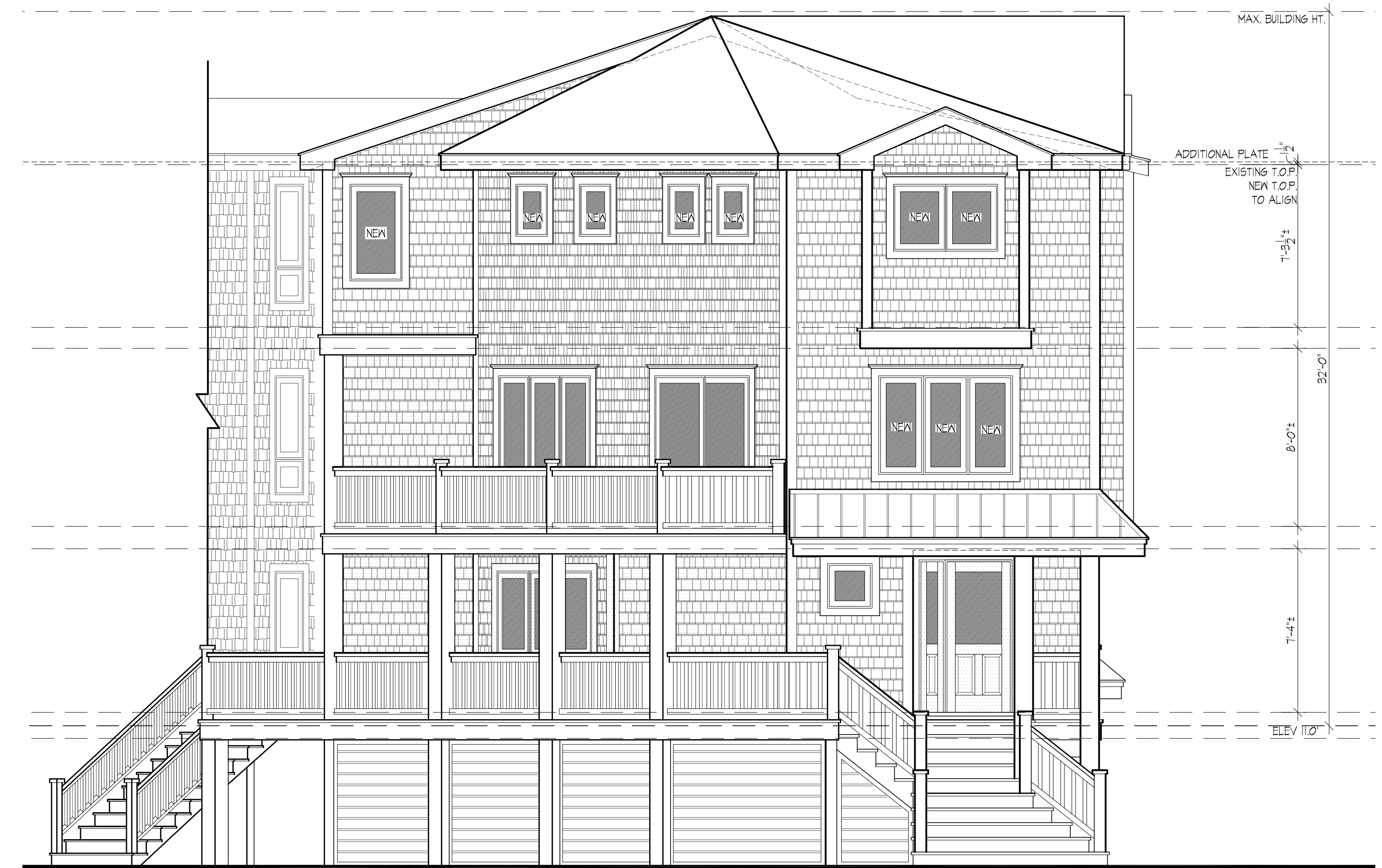
PROPOSED FRONT ELEVATION (59TH STREET) SCALE: 1/4"=1'-0"